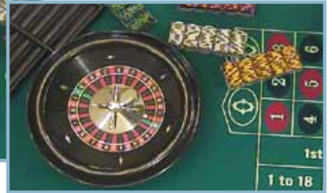
HDTV/Megapixel network camera resolution