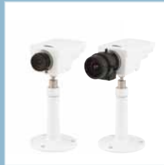
AXIS M1104 AXIS M1114

AXIS M1054 offers 1 megapixel or HDTV 720p resolution. Smart functions such as a PIR sensor, illumination LED, I/O ports and two-way audio with built-in microphone and speaker make it ideal for residences and small business.