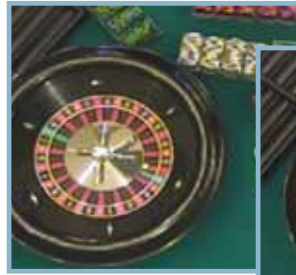
Analog camera resolution

With an HDTV or a megapixel network camera, the resolution is at least three times better than an analog CCTV camera. It boils down to a simple truth: HDTV and megapixel means higher resolution. Higher resolution means more detail. More detail means better possibilities for identification. In addition, a true HDTV network camera provides full frame rate and extended color fidelity, for an even better viewing experience.