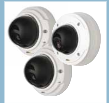
AXIS P3344/-V/-VE AXIS P3346/-V/-VE

AXIS P3304/-V provide 1 megapixel or HDTV 720p resolution. They offer two-way audio, I/O ports, pixel counter and digital PTZ. AXIS P3304-V is also vandal-resistant.